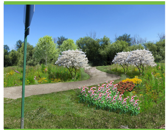
Mature bioswale on the north side of Tireman Avenue in Rouge Park

For the bioretention area along Tireman Avenue in Rouge Park, the completed bioswale will contain flowering shrubs and perennials. This area will take time to establish and grow, but eventually it will look very similar to the project team's rendering.