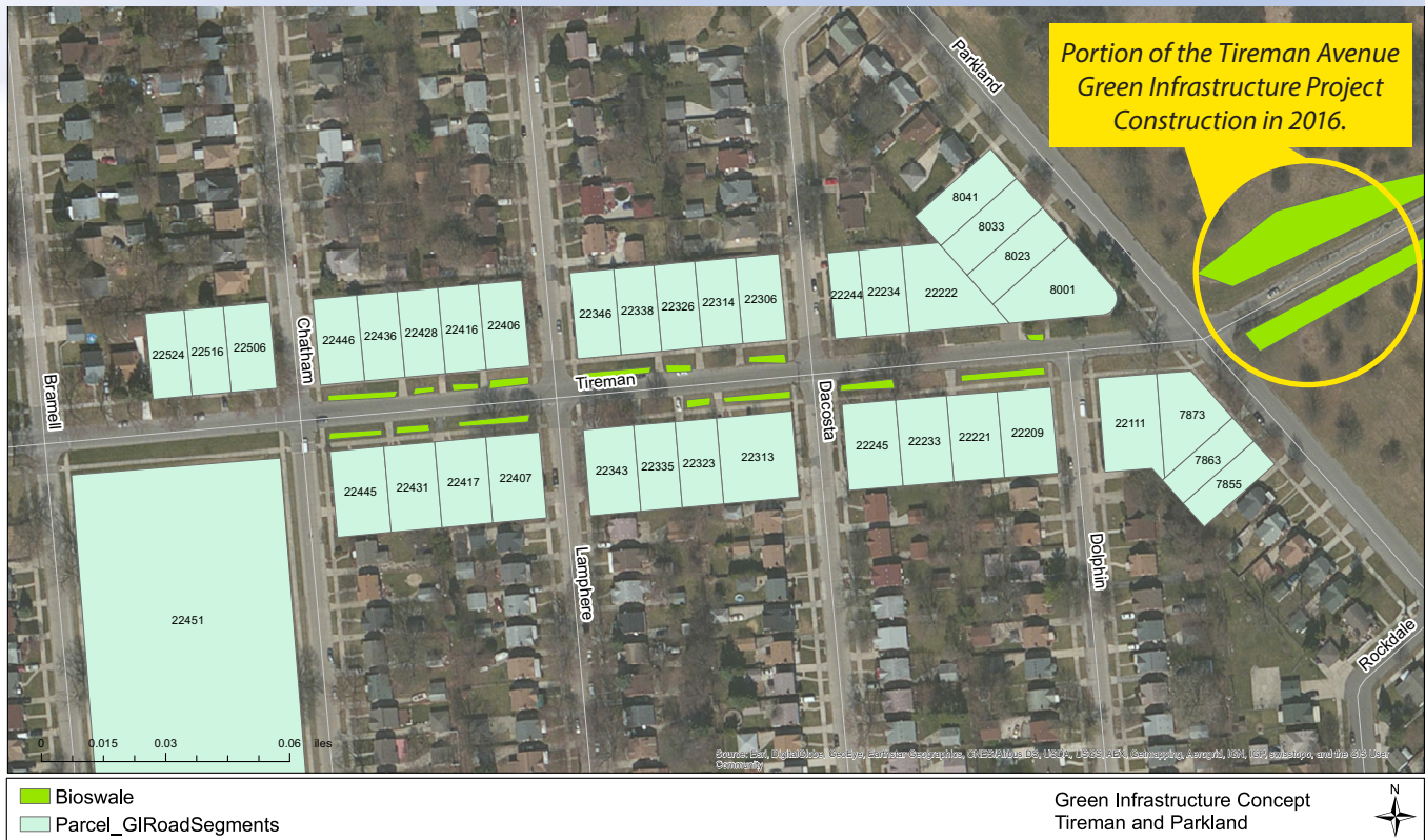
Properties near the proposed bioswale projects on Tireman Avenue